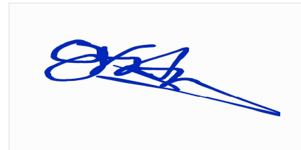
Verified Electronic Signature