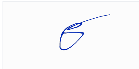
Verified Electronic Signature