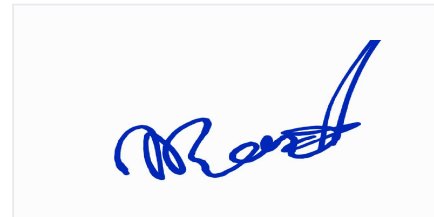
Verified Electronic Signature

Name: Nicola Burns Email: smoosmoo72lw.lw@gmail.com Telephone: 07597689001 IP Address: 154.56.236.53