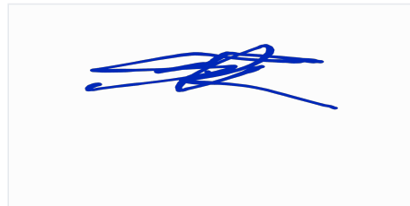
Verified Electronic Signature