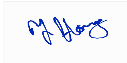
Verified Electronic Signature