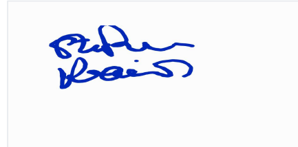
Verified Electronic Signature