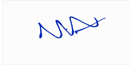
Verified Electronic Signature