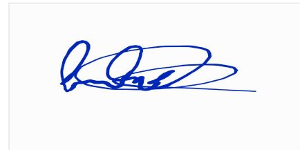
Verified Electronic Signature