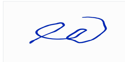
Verified Electronic Signature

Name: Not Provided Email: emmalindsay26@outlook.com Telephone: Not Provided IP Address: 62.56.89.108